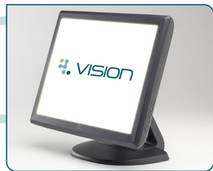
Desk Mounted ELO Unit