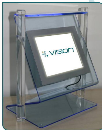
Desk Mounted Plexi-Glass Unit