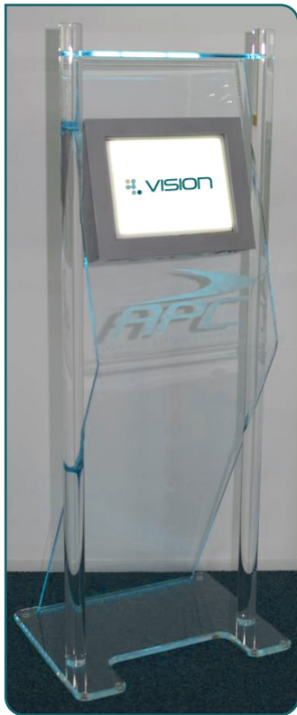
Floor Mounted Plexi-Glass Unit