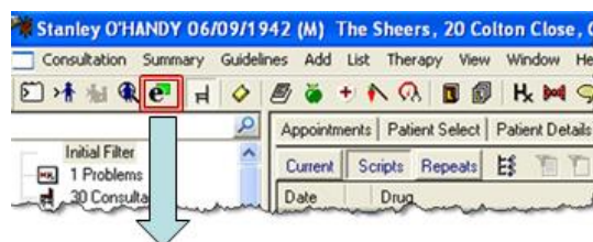
All Prescriptions View – Electronic Prescriptions

Electronic prescriptions processed by non-prescribing users and those that you have marked for signing later can be reviewed as a batch, using the List All Prescriptions View in Consultation Manager.