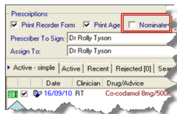
Change the Prescription Type

You can also change the prescription type by removing the tick from the Nominate box and the item with change from an electronic to a paper script.