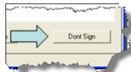
Remove task - without issuing

You can reject a request to remove the task from your list without issuing. Click Don't Sign to cancel the request. The task is removed from your task list.