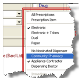
Change prescription type

You can also change the prescription type by removing the tick from the Nominate box and the item with change from an electronic to a paper script.